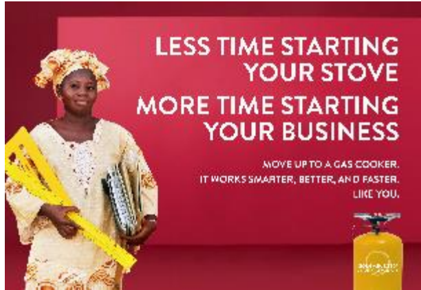
Image sends a signal that LPG is for a certain class of people.