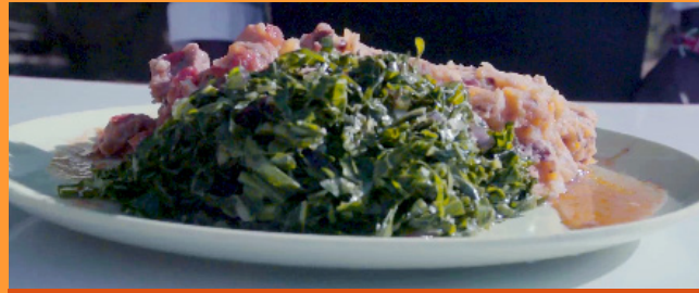
Beef marinated with pawpaw and sukumawiki stew